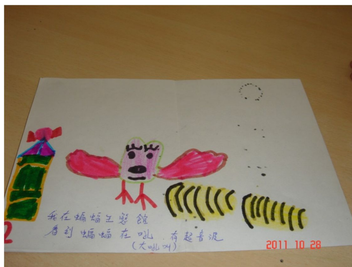
Figure 2. Ping's Drawing

Some children depicted a bat's ultrasonic waves in their drawings. For example, Ping described her drawing (Figure 2) by saying, "I saw a bat roaring. He made ultrasonic waves" (Interview with Ping, 10/28/2011).