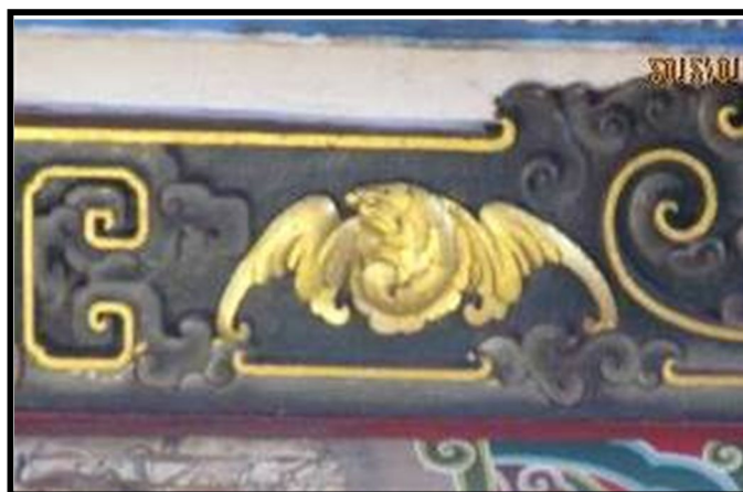
Figure 6. Golden Bats in the Wooden Sculpture on the Beam