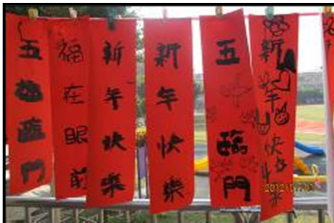
Figure 5. Children's Artwork of Chinese New Year Scrolls

is bian-fu (蝙蝠). Fu (蝠) implies “good luck” (福). She guided them to observe the symbol of bats in the Chinese New Year scrolls. The children further created their scrolls with figures of bats (Figure 5). Some of them even wrote “You have good luck” on the scrolls.