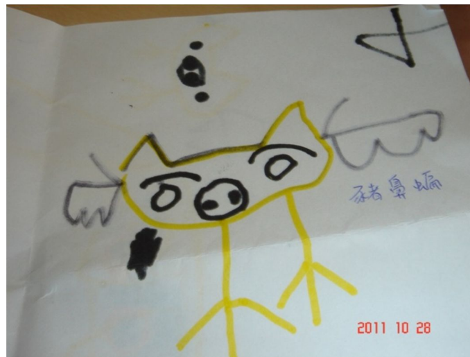
Figure 4. Shaio-Bu's Drawing